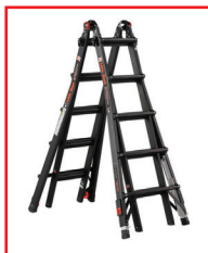
Little Giant Black Pro