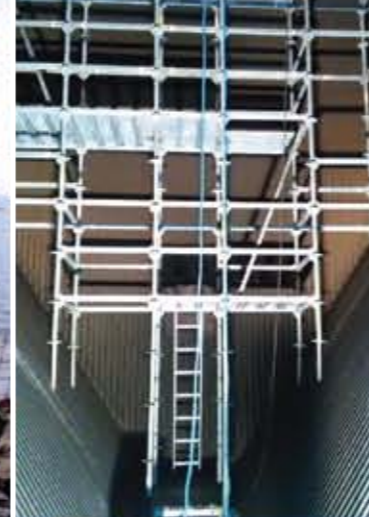
VTTV TANKS MAINTENANCE Client: VTT Vasiliko Ltd Area: Port of Vasilikos

The maintenance of tanks containing different types of petroleum products (e.g. gasoline, diesel) is a specialized work that has particular difficulties and for this reason requires great care and precision. Our company is fully aware of the Health & Safety demands for these kinds of projects. Therefore, we proposed to the client to construct a movable scaffold inside the tank. The scaffolding was placed on rubber wheels so that it could move cyclically around the tank without of course scalping the floor surface.