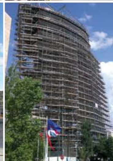
WARGAMING GLOBAL HQ Client: Wargaming.net Area: Nicosia

It was requested by the contractor of the building to erect scaffolding all around the building to enable them to execute their works. Our company took into account the height, design and complexity of the building and came up with the best and most cost effective solution. The works were completed using Tube and Fitting and Cuplock systems.