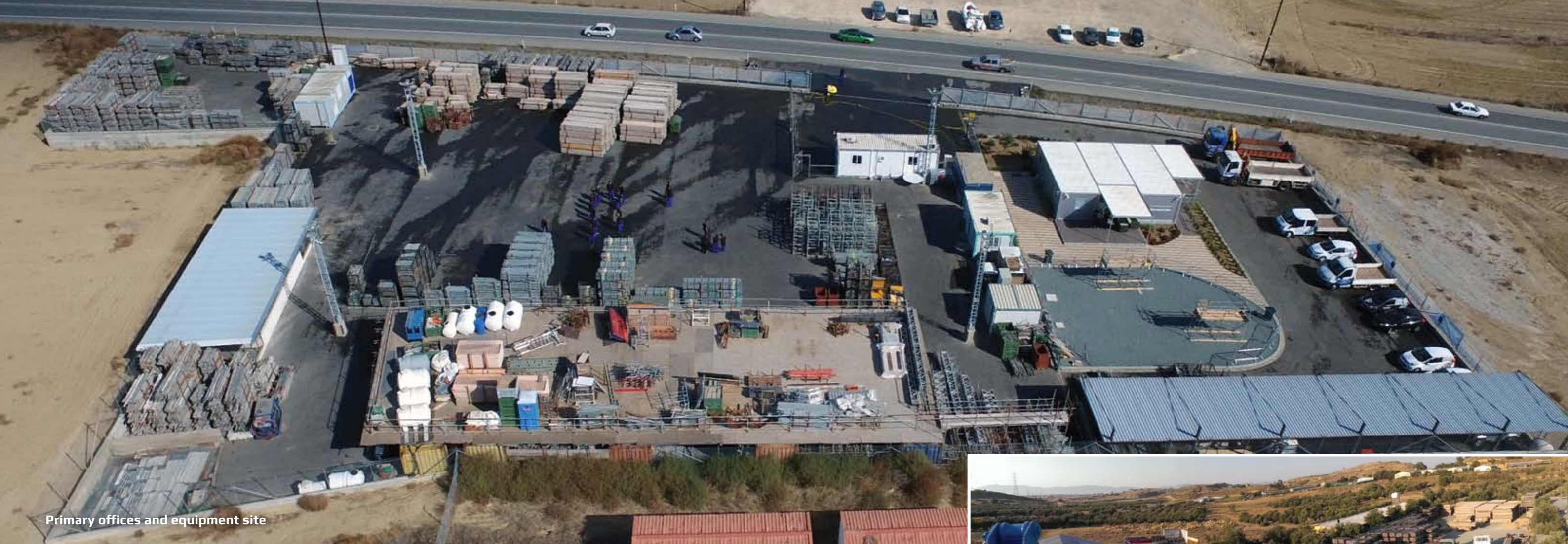
Primary offices and equipment site