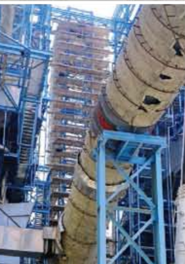
VASILIKOS POWER STATION Client: EAC Area: Vasilikos Size: 50000 qm 3

Scaffolding erection for several contractors to assist the reinstating of the Vasilikos power station. The project was demanding and we had to work under pressure and long hours in order to accommodate our various customers. There were time limits set and extensive works held by all contractors. We gave solutions to access difficult areas utilizing a large amount of our scaffolding in the particular project and many times found ourselves working 24/7.