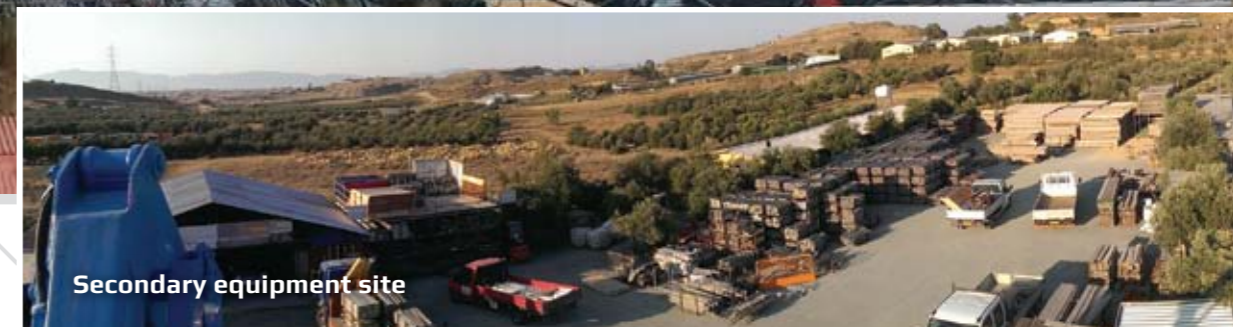
Secondary equipment site