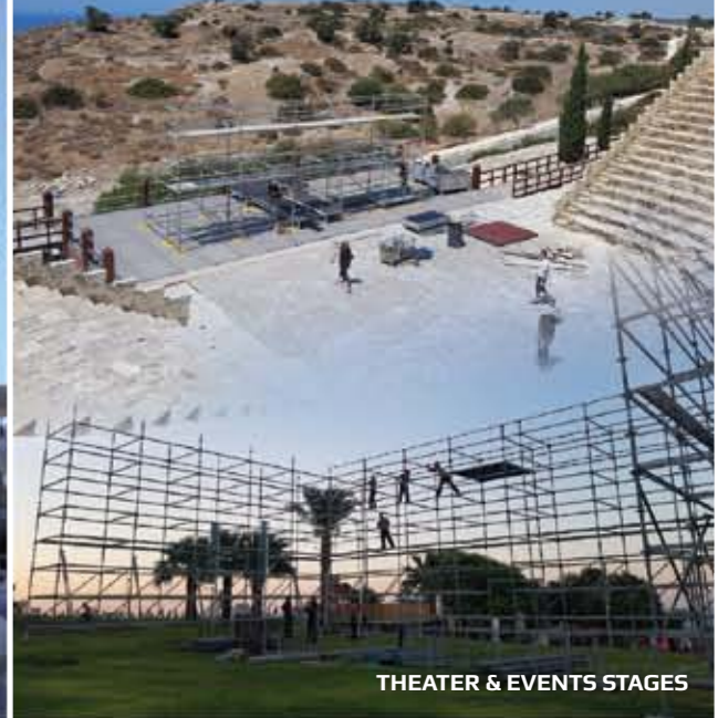
THEATER & EVENTS STAGES