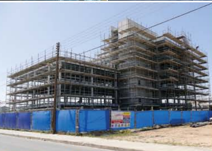
KARYATIDES BUSINESS CENTRE - KBC Client: Karyatides Developments Ltd Area: Strovolos Size: 3000 m 2

KBC is an imposing building with unique design in a central area of the capital. Our company using a combination of two scaffolding systems erected a scaffolding around the building with loading platforms and extensions at various levels and also an external staircase. In addition, we were asked to erect mobile scaffolding towers inside the building and this was done very easily by using BOSS aluminum scaffolding.