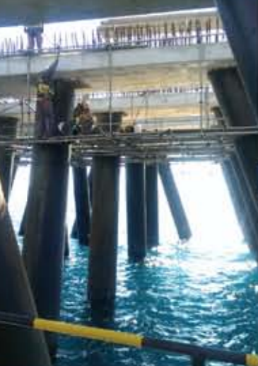
VTTV JETTY & FUEL TERMINAL Project Name: VTTV Terminal Client: GIR.OIL Enterprises Ltd Area: Vassilikos, Zygi area Size: 4300 sq.m.